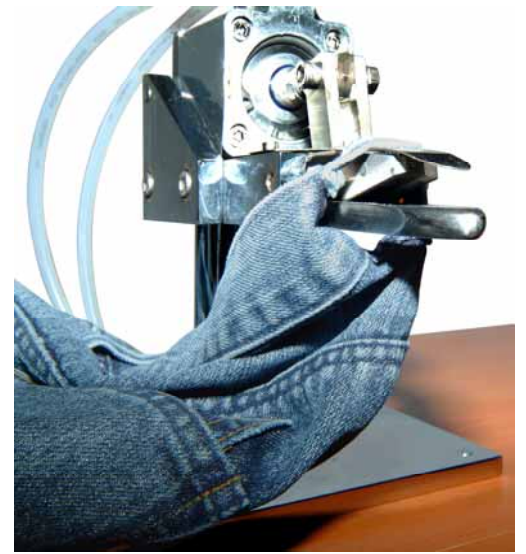
Table and foot pedal Set